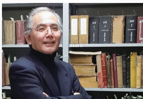
Director of the Center and Professor of Kansai University Faculty of Foreign Languages Studies

KU-ORCAS (Kansai University Open Research Center for Asian Studies) is based on the academic resources and the international academic network of the "East Asian Cultural Studies at Kansai University". KU-ORCAS will create an open platform with a hub function open to everyone, which can be accessed freely from anywhere in the world. Thanks to the birth of exchanges surpassing divisions between different disciplines and people, we believe it is possible to open new horizons in global East Asian cultural studies and in the humanities. Together, let's form a "New image of East Asia".